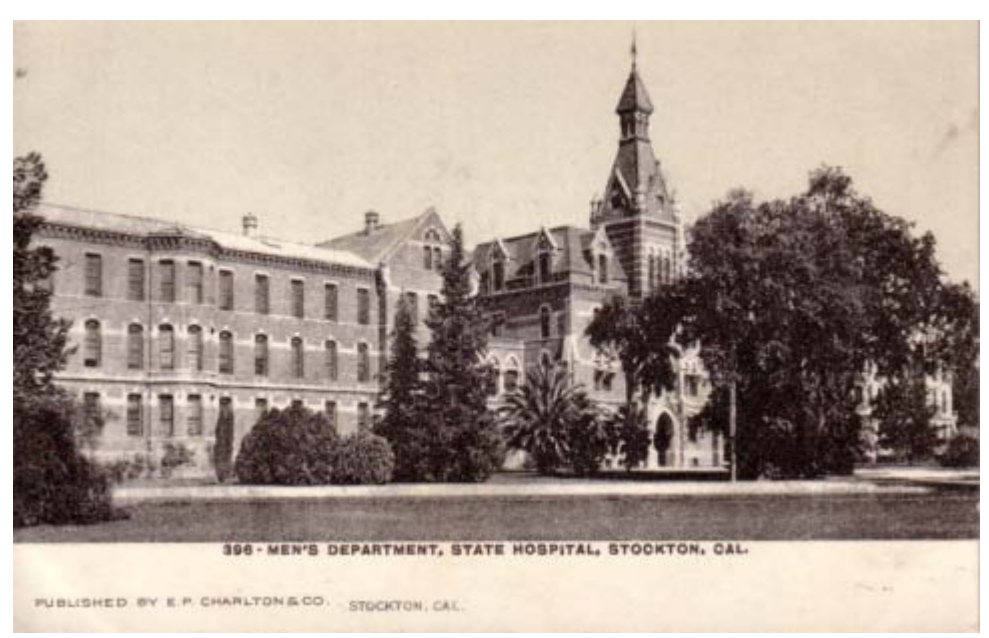
Stockton State Hospital founded 1851

The family care of people with mental illness In the United States dates back to colonial times. In the early years of the republic, families were responsible for meeting the basic needs of their relatives with serious mental illness. Though such care was most often a private matter, the care of "distracted persons" or "lunatics" became the community's responsibility when a mother or father became ill and could no longer work, a loss that could spell financial ruin for the family.